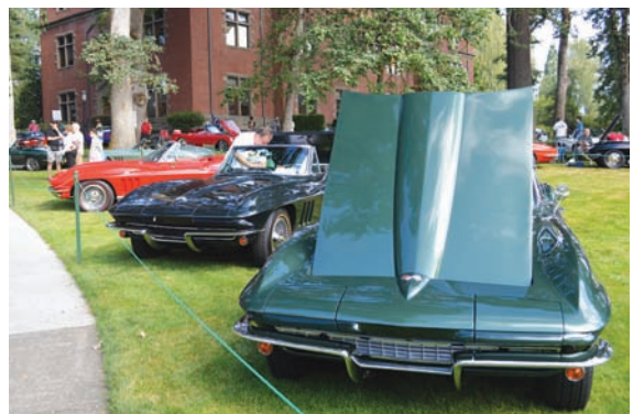
Honoring 60 Years of the Corvette