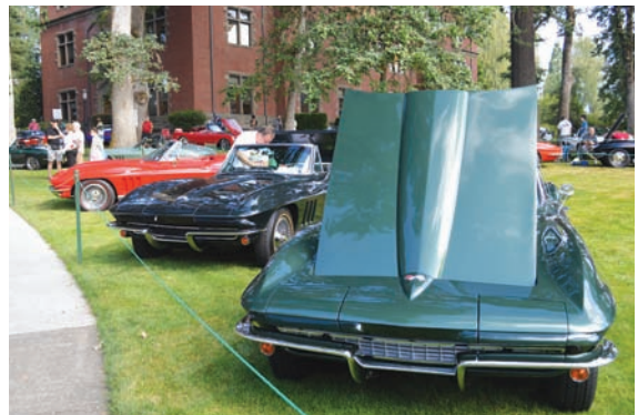
Honoring 60 Years of the Corvette