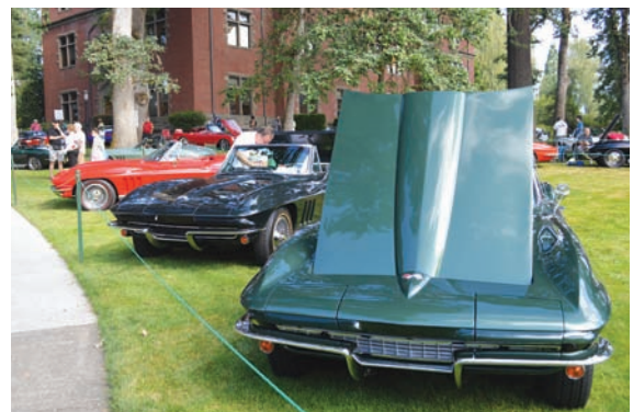
Honoring 60 Years of the Corvette